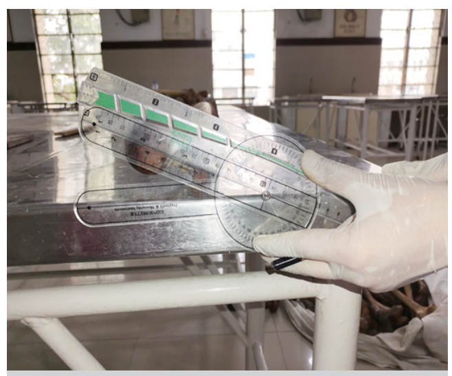
Figure-3. Methodology for the measurement of Neck-Shaft angle