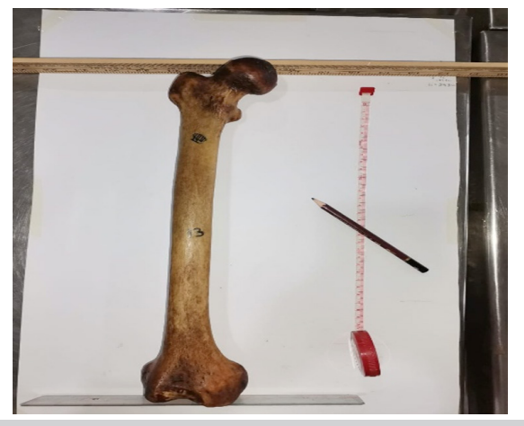
Figure-1. Methodology for the measurement of total length of femur

the head and the other at the lowermost margin of the condyles. The distance between the two points representing the total length of the femur was recorded using a well-calibrated measuring tape. (Figure-1)