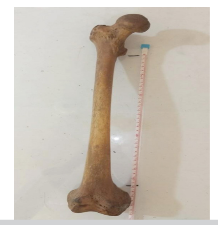
Figure-2. Methodology for the measurement of shaft length of femur

For measuring the angle of torsion, the bone was placed on a smooth horizontal surface, such that the condyles were resting over it completely. Thus, the surface was considered the axis of femoral condyles, and by using a transparent scale ruler, the axis of the head and neck was determined. The angle between the two axes was measured using a goniometer, showing the angle of torsion. (Figure-4)