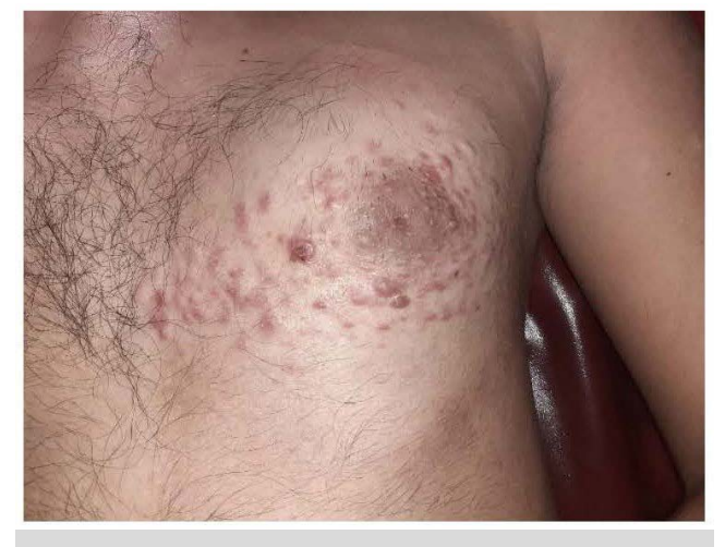
Figure-1. Pre-op Leiomyoma, Rt anterior chest wall.

Histological examination of incision biopsy revealed two tissue fragments showing skin with an underlying circumscribed nodular lesion showing proliferation of spindle cells in clusters and fascicle. The individual cells have elongated nuclei and moderate amount of cytoplasm. No increased mitotic activity or areas of necrosis are identified in the lesion foci. No malignant evidence was observed in speciman. Immunostains: Desmin: Positive, SMA positive. Preoperative photography was done. All base line blood tests were normal. Excisional of lesion with one cm margin was done to achieve complete clearance followed by split thickness skin graft harvested from thigh. Tie over bolster dressing was done. Donor area was dressed with Bactigrass dressing and dry gauze and sterilized cotton and crepe bandage applied on it. Patient was followed fortnightly for six months.