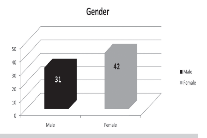
Figure-1. Gender distribution of study group.