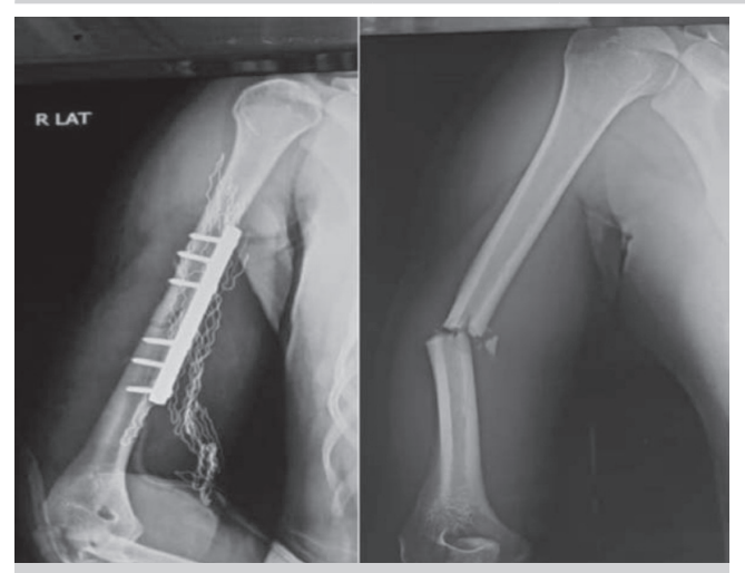
Figure-1. Pre-operative and postoperative radiograph of fracture shaft of humerus fixed by anteromedial plating.

Table-III. Stratification of functional outcome concerning the type of fracture.