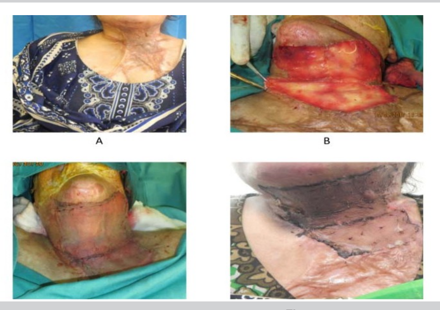
FIG. 3 Pre op picture (A), Intra op pictures with integra & STSG (B,C), Post op picture with complete take of graft (D)